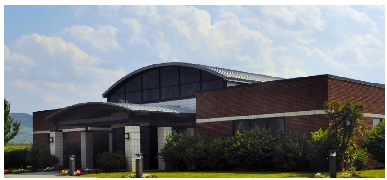
Airport Corporate Park