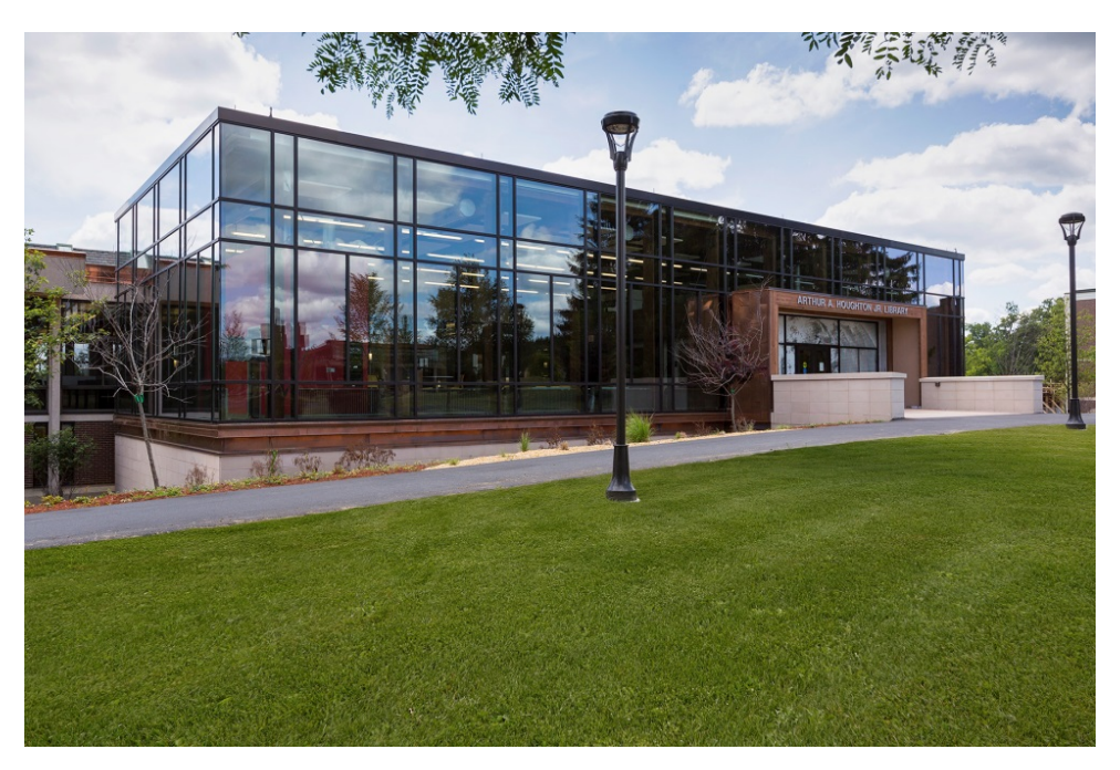
Arthur A. Houghton Library

In a power outage, the Perry Hall fire alarm system has 90 minutes of back-up power. In the event the power in Perry Hall goes out, residents may stay in the building for 60 minutes waiting for the power to restore. If the power does not restore within 60 minutes, residents will be evacuated to the Commons Building.