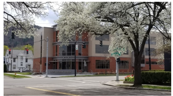
The Health Education Center located in the City of Corning