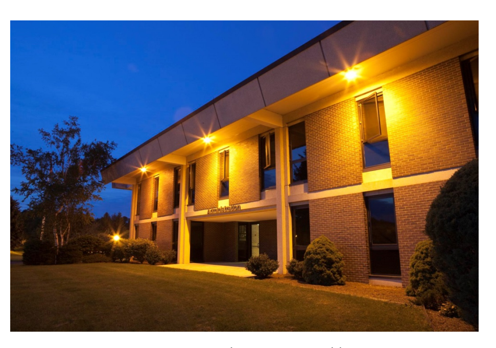
Parsons Administration Building