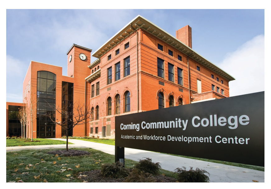
Elmira Academic and Workforce Development Center