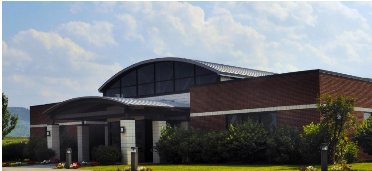
Airport Corporate Park

Title IX procedures can be located in Appendix A at the end of this document.