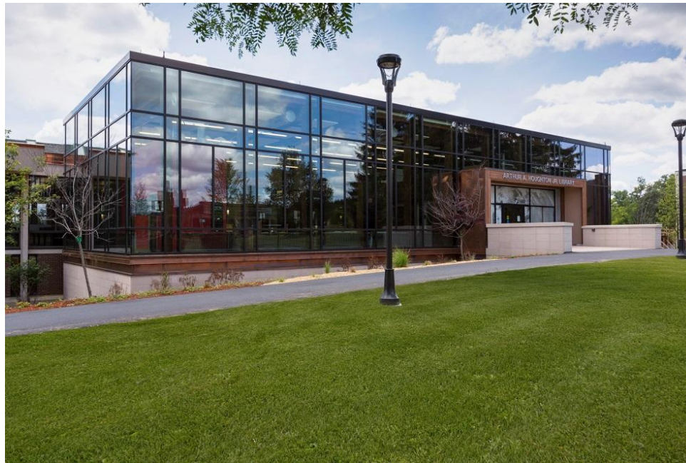
Arthur A. Houghton Library

In a power outage, the Perry Hall fire alarm system has 90 minutes of back-up power. In the event the power in Perry Hall goes out, residents may stay in the building for 60 minutes waiting for the power to restore. If the power does not restore within 60 minutes, residents will be evacuated to the Commons Building.